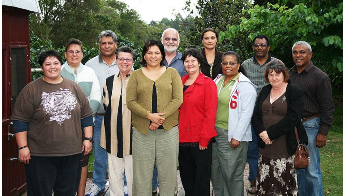
First BYB Group